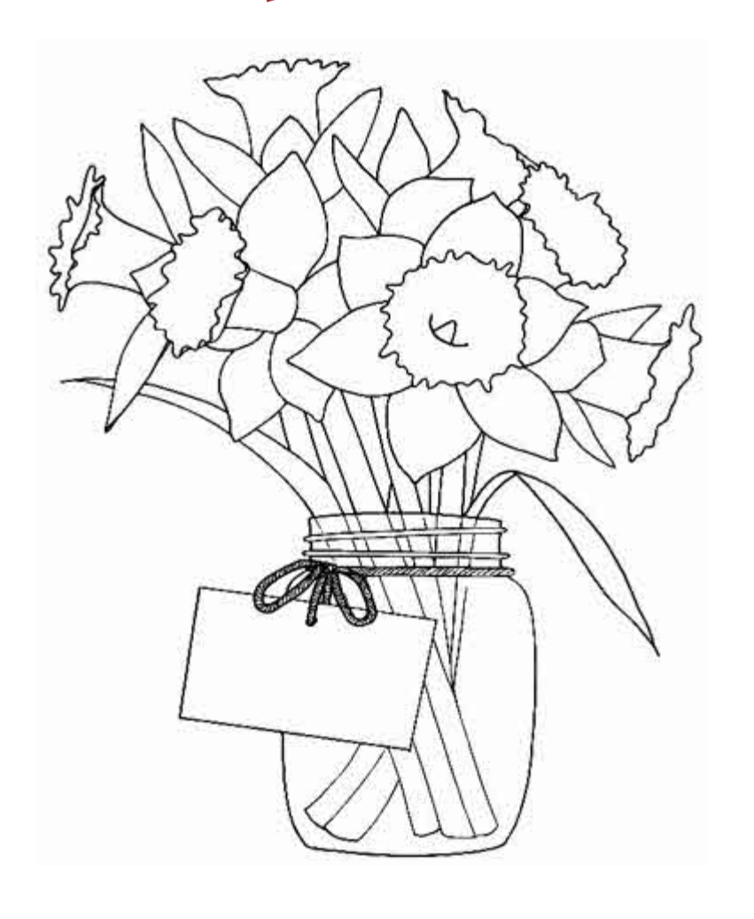
February & March 22